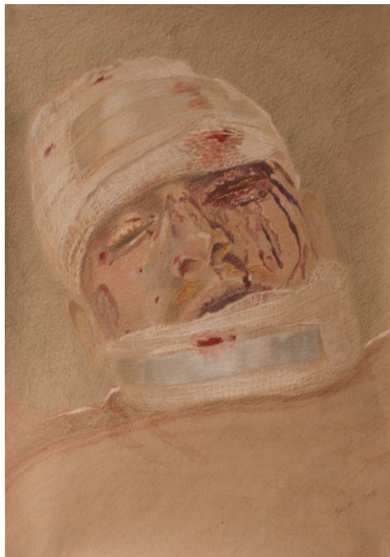
Fig. 13.2 By © Simone Aaberg Kærn, 2010, coloured pencil on rough paper. The ‘soldiers’ are wounded Afghans who have been made ‘Danish’ by changing their eye and hair colour

act of representation, and, thus, of pointing beyond (Butler 2006) to all that is not captured in the portraits. Hence, although these faces, in contrast to those of the politicians, do indeed explicitly express suffering and convey vulnerability, it is a displaced or distributed suffering and vulnerability that stems not only from the ‘portrayed’ wounded ‘Danish soldiers’, but also from the absent-present bodies of Afghans, the civilian, allied and enemy victims of Danish warfare. Thus, through its striking hybridization of faces and the explicit ‘failure’ of representation, the RAMT series